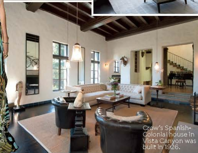
Crow's Spanish Colonial house in Vista Canyon was built in 1926.

the market for $15,950,000 last fall. The more than 10-acre compound (created when Crow combined two separate properties) is linked by an infinity pool and hiking trails that lead to the top of the canyon. The property consists of the main 1926-built Spanish-Colonial house to the two guest houses: one, a four-bedroom, three-bath painstakingly restored Craftsman-style bungalow, and the other, an 1885 cottage complete with three bedrooms, and two bathrooms. With the estate's retreatlike feel, one can find inspiration—or have some serious fun—next to the teepee or under the thatched roof of a tropical palapa . Myra Nourmand and Joanne Vuylsteke of Nourmand & Associates Realtors ( nourmand.com ), represent the gated compound.