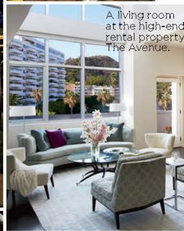
A living room at the high-end rental property The Avenue.