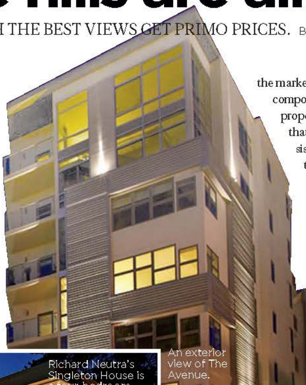
An exterior view of The Avenue.

CHART-TOPPING SINGER/SONGWRITER Sheryl Crow put her exquisite three-house property atop a Hollywood Hills canyon on