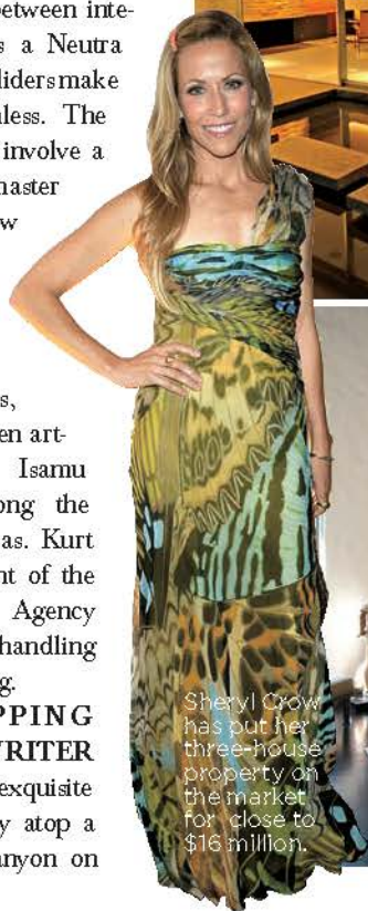
Sheryl Crow has put her three-house property on the market for close to $16 million.